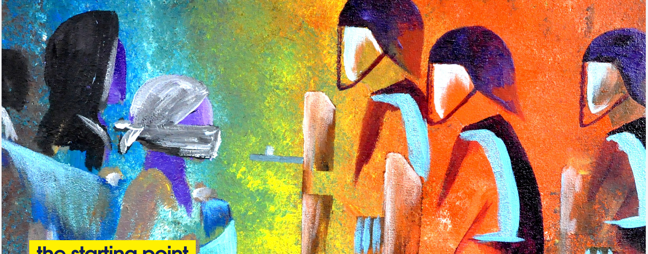
ARTWORK: BOUSH MUSA