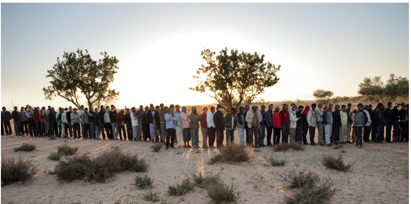
Hundreds of refugees from Libya line up for food at a transit camp near the Tunisia-Libya border.