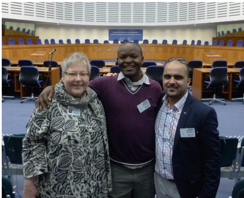
Friends from Sweden, Kenya and Palestine in the chamber at the European Court of Human Rights, as part of the QCEA Study Tour.

life, the prohibition of torture, the prohibition of slavery, the right to liberty and security, the right to a fair trial and to no punishment without due process, the right to respect for private and family life, to freedom of thought, conscience and religion, and freedom of expression - all these were adopted in enforceable law based on shared European values.