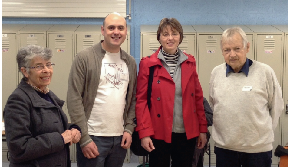
Friends at Ireland Yearly Meeting