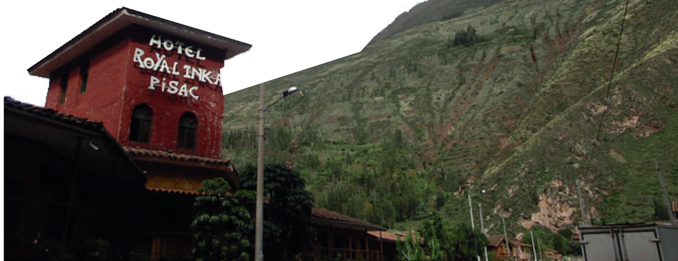
Friends met in Pisac, Peru, where it was difficult to forget or ignore the power and importance of nature