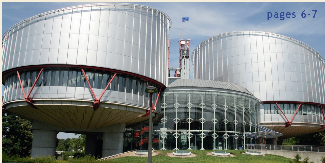
European Court of Human Rights

Alternative to ISDS agreed between EU and Canada page 12