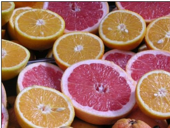
Loose grapefruits in Israel.

There is evidence to suggest that some Israeli exporters are circumventing EU trade rules by using the name and postcodes of an Israeli site on customs declarations rather than the actual production location. 19 A Member of Parliament brought this to the attention of the UK House of Commons in 2010 when she described how an article in Israeli business magazine Globes advised that Israeli companies could use addresses located in Israel proper to avoid paying customs duties: "The method is easy: you invent an address within the Green Line and operate using this address. In this way you do not have to pay the customs fees that apply to products exported from across the Green Line. The method works, but not for those whose company carries a name that gives away the true location - such as Golan Height Wineries." 20