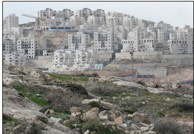
More than 9000 Israeli live in Har Homa settlement in the West Bank

Settlement communities benefit from services provided by the Israeli Civil Administration and private investors, while the Israeli Army spends much of its time patrolling and protecting the settlements. A dual legal system discriminates against Palestinians in the West Bank with Israelis subject to Israel's civilian law and Palestinians living under military rule.