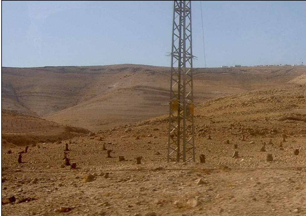
Palestinian olive trees chopped down by settlers in the West Bank

As settlements expand in the West Bank, tensions and conflict between the communities increase. Violent attacks by both Israeli settlers and Palestinians have risen dramatically in recent years.