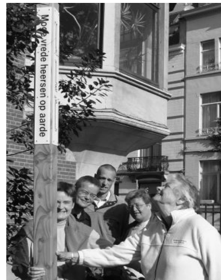
Quakers marking International Peace Day